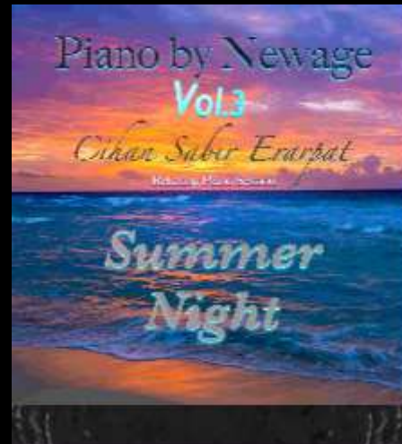
Piano by Newage Summer Night