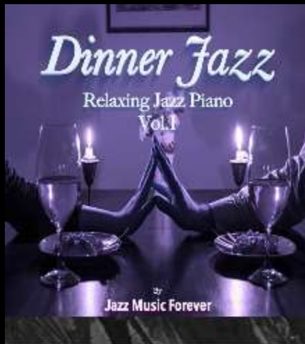
Dinner jazz relaxing jazz piano