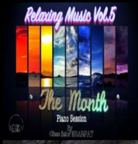
Relaxing Music Vol.5 The Month