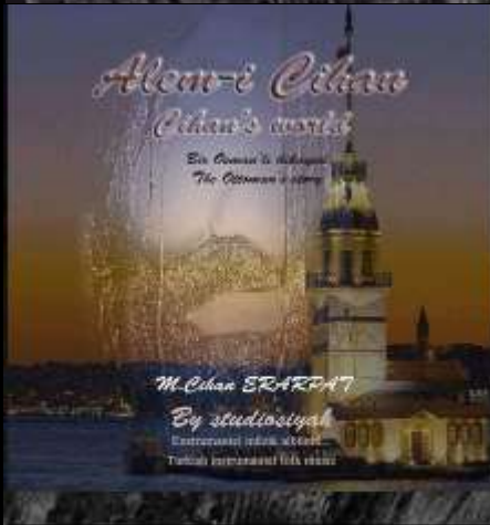
Alem-i Cihan The Ottoman Story