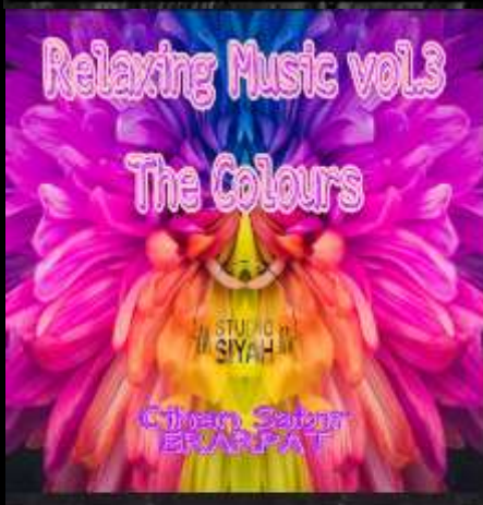
Relaxing Music Vol.3 The Colours