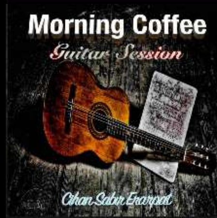
Morning Coffee Guitar Session