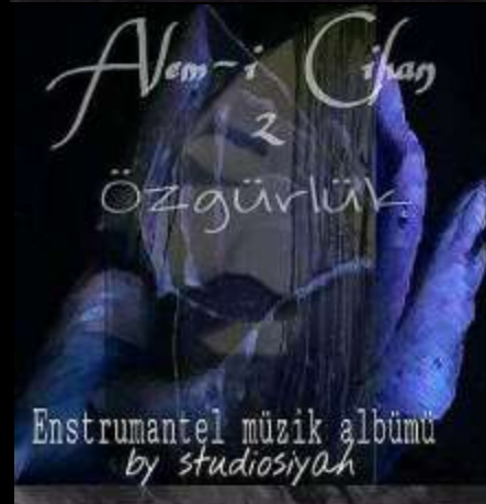
Alem-i Cihan 2 The Libert