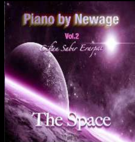
Piano by Newage The Space