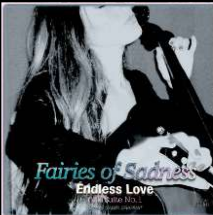
Faires of Sadness Endless Love Cello