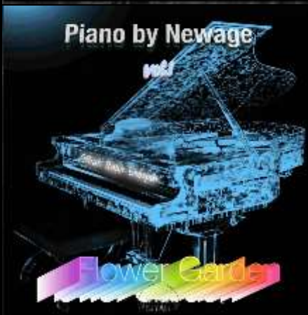
Piano by Newage The Flower Garden